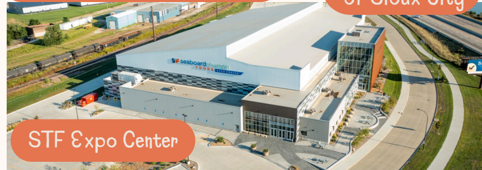
STF Expo Center