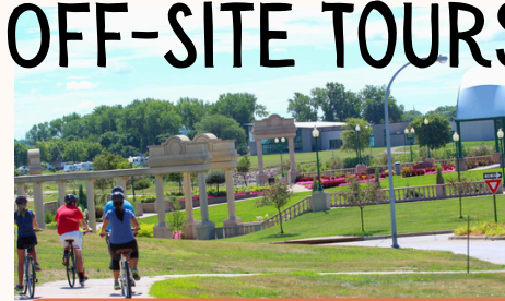
Chris Larsen Park (Riverfront)