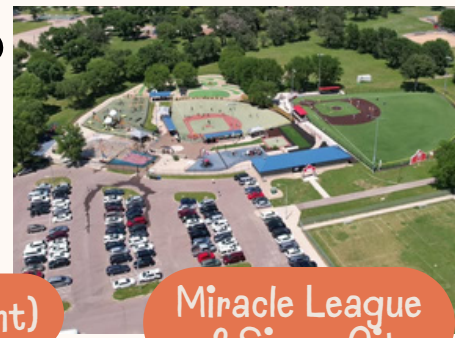
Miracle League of Sioux City